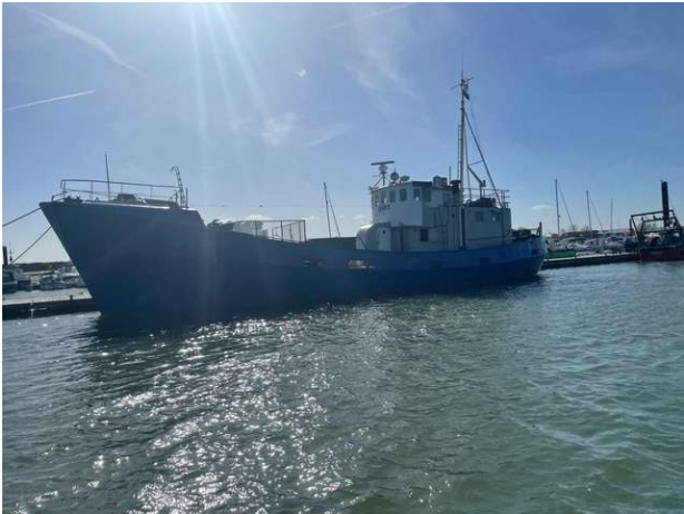
Image 1961 Liveaboard Converted 25M Steel Trawler Houseboat